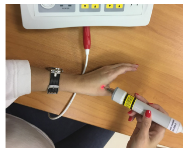
Figure 1. The Process of AP Laser Illumination.

Laser light is not only a very convenient alternative to traditional needles and the complicated manipulation techniques they require, but also a more efficient tool. The study by Denisova 29 is of interest in this respect; the scholar directly compared the effectiveness of these three methods in patients suffering from gonarthrosis: classical